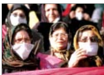
Women have played an important role in anti-pollution schemes.

Director general of the DoE's Office for Information and Planning Office added that one of the most important objectives of the department is to raise the awareness of women as well as environmental executives and policymakers as two groups who have a major influence on the environment. She said women comprise the majority of members of environmental NGOs operated by women directors.