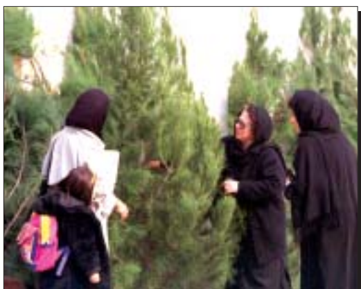
Armenian women in Tehran buy Christmas trees on the eve of Christ's birth—Dec. 24.

Emily Dickinson (American poet, 1830-86): A mother is one to whom you hurry when you are troubled.