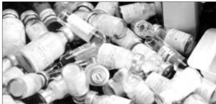
Imported drugs are twice as expensive than those produced in the country.

Our duty is to ensure that the medicines are healthy and have the necessary therapeutic effects.