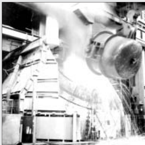
The steel industry is now independent in terms of exploitation, maintenance, storage, reform and development projects.

rates in a bid to have a sustainable, valuable and strong steel industry.