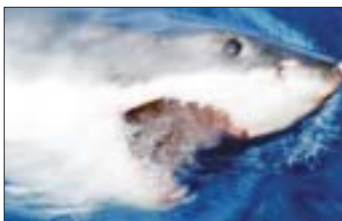
Shark hunting in the Persian Gulf is the major threat to the species.

He said that although shark is not considered as endangered, there has been a drastic decline in the number of several species.