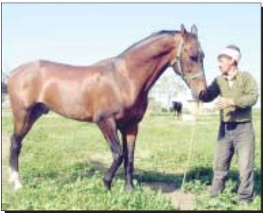
A farmer strokes a purebred Turkman horse in Jargalan, Bojnourd, northeast of Iran.

And forget not that the earth delights to feel your bare feet and the winds long to play with your hair.