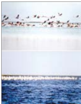
Miankaleh peninsula and wetland is being monitored by UNESCO, the 1971 Ramsar Convention on Wetlands and the Convention for the Protection of the Marine Environment of the Caspian Sea.

ing DoE's hesitation in purchasing the areas under question over the