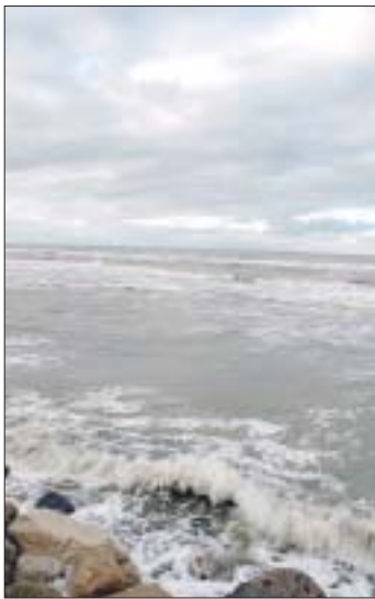
Iranian provinces located on Caspian shores are responsible for 6 percent of the total pollution.

He added that Iran had taken effective measures in recent years to reduce Caspian pollution, insist-