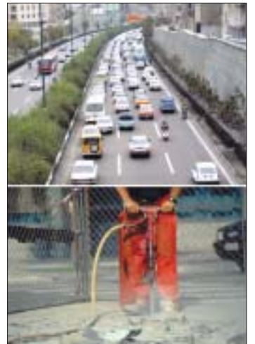
Tehran Municipality is preparing noise maps for every district.

ing on construction projects. The noiseless