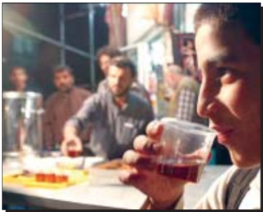
A young boy breaks his fast during Ramadan in Tehran.

Do not handicap your children by making their lives easy.