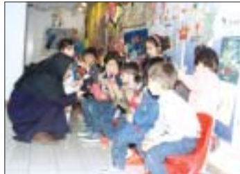
Kindergartens will be classified in the near future based on their facilities and services.

Addressing the same gathering, director general of SWO's Office for Children and Young Adults observed,