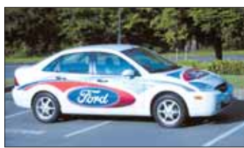
Launched as a demonstration program in 2002, the Hydrogen Highway will form a corridor that runs between Vancouver International Airport, the City of Vancouver and Whistler.

other. To test his theory, Grove built the world's first fuel cell. In a delightful twist of irony, interest in his invention quickly waned because of the dawning of a new age and fuel source gasoline. Since then, the fuel cell has come a long way. Consider the unit that powers Honda's FCX. It addresses two of the problems that plagued many early fuel cell-powered vehicles. In the past, efficiency and getting the fuel cell to operate in cold weather were major headaches. The FCX's fuel cell, designed and built in-house by Honda, not only delivers an increased driving range and better efficiency (the 304 kilometers it squeezes out of each fill-up is 20 percent greater than the fuel cell it replaces), it also has the ability to function at temperatures as low as -20°C. Outwardly, decals aside,