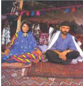
A Bakhtiari couple in their tribal tent

Kohkiloeyeh-Boyerahmad is home to 13,300 tribal households with a 92,000 population.