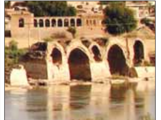
Historic Shadravan Bridge in Shoushtar, Khuzestan province

A cultural heritage officer expressed concern over the damages caused to historic buildings by graffiti, complaining about a commercial graffiti on an ancient bridge in Shoushtar, Khuzestan province.