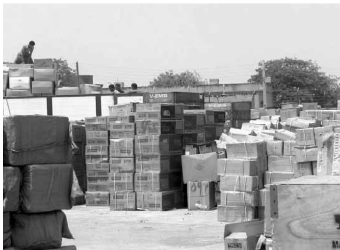
With the ongoing globalization trend in which international frontiers make little sense, goods are imported into the country through legal and illegal channels.

higher productivity rate. So bankruptcy was used as a mechanism to filter out the 'bad blood from the veins of the economy' in order to create a healthy atmosphere for those who had the potential to carry on their activities to the advantage of the society. Also, the West created a proper system of training and education to help those who had the neces-