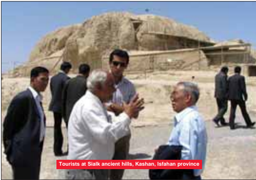
Tourists at Sialk ancient hills, Kashan, Isfahan province