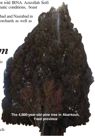
The 4,000-year-old pine tree in Abarkouh, Yazd province

Every village has a tourism identification document recording information such as population, location, public facilities, climate, souvenirs and dialects.