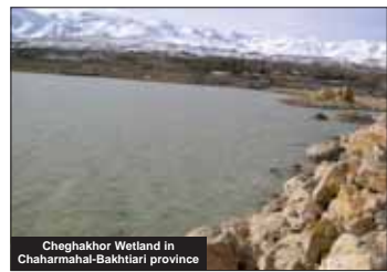
Cheghakhor Wetland in Chaharmahal-Bakhtiari province

racing clubs, Chaharmahal-Bakhtiari province, lying in the heart of the stately Zagros mountain range, can turn into a sport tourism hub.