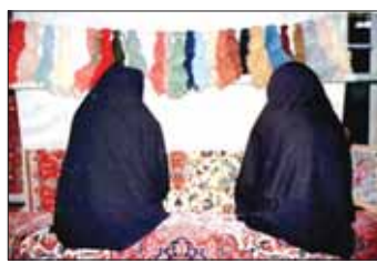
Close to 400,000 women-led households are not covered by support organizations.