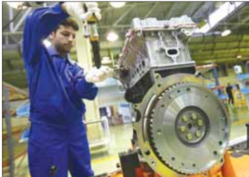
First domestically-produced car engine production line inaugurated in Tehran on Tuesday.

"Everybody should strive to help the country reach self-sufficiency in