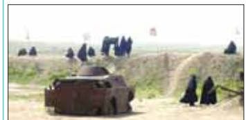
Under the initiative, visitors could go on tours of ex-battlegrounds.

Esfandiar Rahim-Mashaei, who was speaking at the first meeting of War Tourism Taskforce, stated that the 'Comprehensive War Tourism Plan' will be prepared to