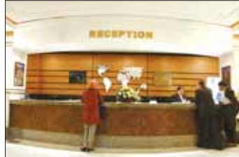
Tehran lodges can accommodate over 10,000 tourists.

He regretted that sightseers are not acquainted with provincial tourism fascinations due to inadequate information dissemination.