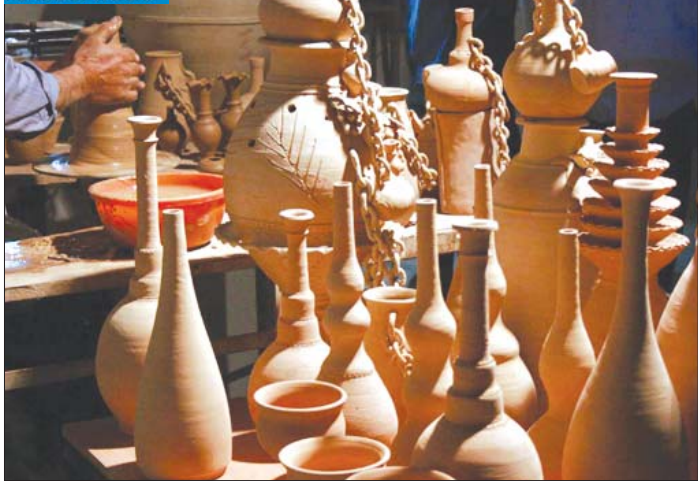
Iranian pottery at the nationwide Handicraft Exhibition in Kerman