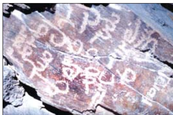
A sample of Pahlavi script

Based on archeological studies undertaken by