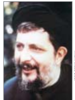
Imam Musa Sadr

In 1978, Imam Sadr mysteriously disappeared on his way to Libya. Some people believe that he is still alive while others think that he was martyred.