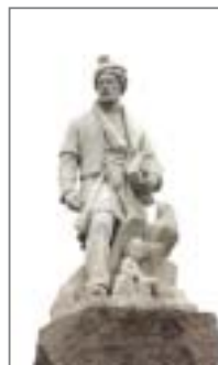
The statue of Hakim Abolqasem Ferdowsi