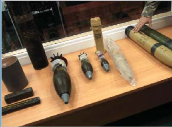
Explosives used by Iraqi militants are seen in this file photo in Baghdad.

There is no evidence to support claims that weapons used by Iraqi insurgents are provided by Iran and the US is paddling back on the allegation, the Los Angeles Times has reported.