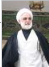
Gholamhossein Mohseni Ejei

According to IRNA, Ejei made the announcement while talking to reporters on the sidelines of the induction ceremony for new Interior Minister Mehdi Hashemi.