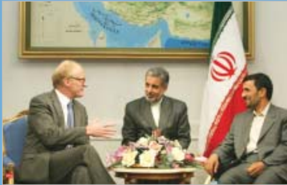
President Mahmoud Ahmadinejad (r) talks with the Special Representative of the UN Secretary-General for Afghanistan Kai Eide in Tehran on Monday.

President Mahmoud Ahmadinejad said Iran calls for full restoration of democracy to Afghanistan and for a timetable for the withdrawal of foreign forces from the country.