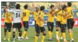
➤ Sepahan players

Thirteen matches will be held on May 21 in the Asian Champions League to determine which three teams will reach the knockout stage. So far, Uzbekistan's Kuruvchi, Iran's Saipa, Kuwait's Alqadisia and Japan's Gamba Osaka have reached the knockout stage while Japan's Urawa Reds is automatically present in this stage as last year's champion, MNA reported.