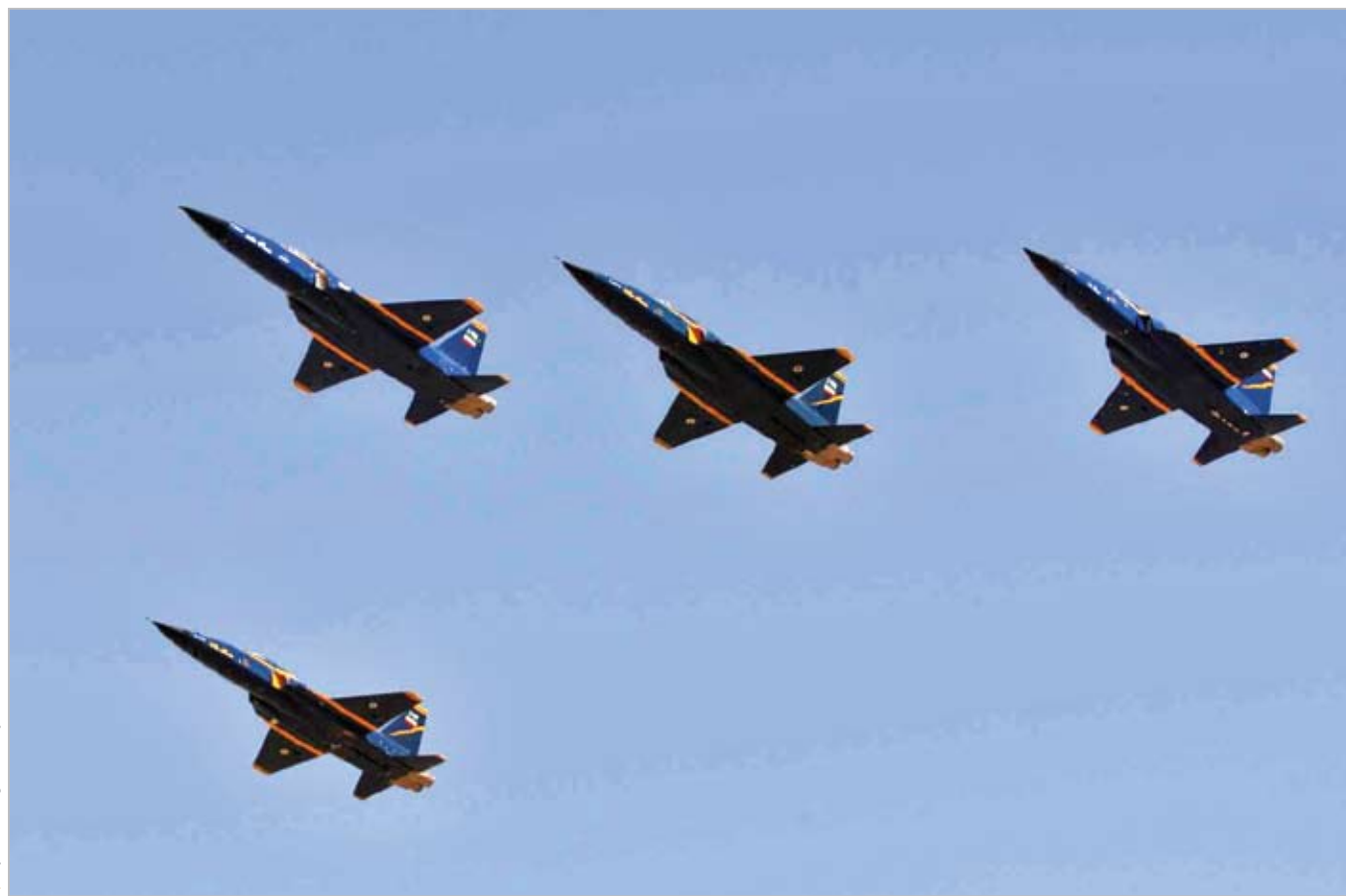
Iran's domestically-made Saeqeh (Thunderbolt) fighter jets join the Air Force on Saturday.

Five more domestically-made Saeqeh (Thunderbolt) fighter jets joined the Air Force on Saturday.