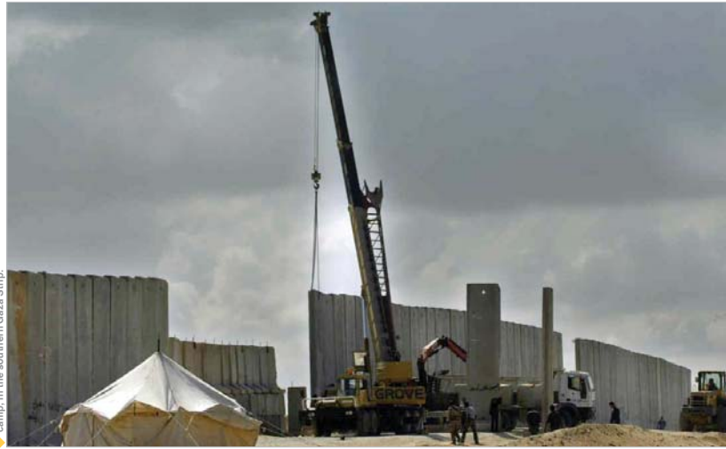
File photo shows workers sealing the border wall between Egypt and the Rafah Refugee camp in the southern Gaza Strip.

Egypt has begun building an underground wall up to 100ft deep along its border with the Gaza Strip to block tunnels used to transfer goods.